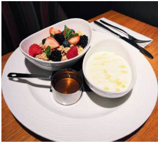
Granola Gossip: Cereal so crunchy, it will spill all the morning tea!