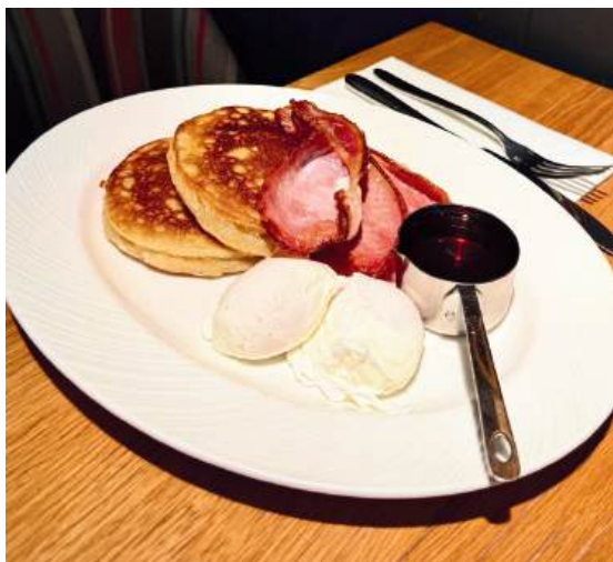
Sport Update: At Souter's, local hero finishes pancake stack in record time